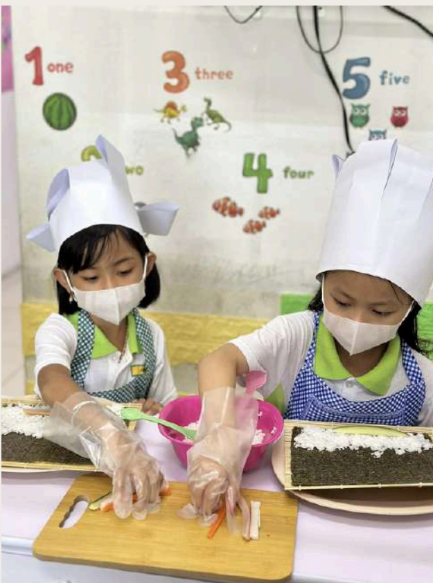
A Photo of 3Q MRC Junior Padang Serai