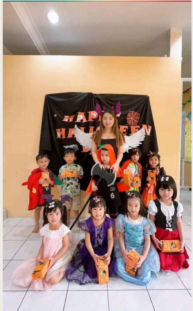
A Photo of 3Q MRC Junior HuiSing